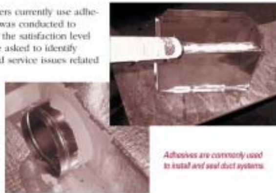
Adhesives are commonly used to install and seal duct systems.

Visit TECHNOLOGIES online at www.mhrahome.org