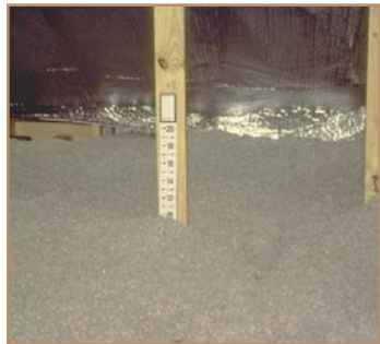
Adding attic insulation while maintaining proper ventilation can improve comfort, lower energy bills, and reduce moisture-related roofing problems.