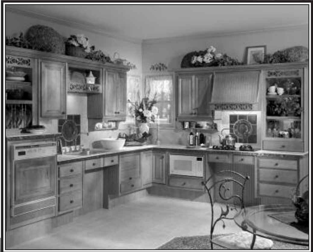
ROSE HALL SQUARE MAPLE

“Universal design requires an understanding and consideration of the broad range of human abilities throughout life.”