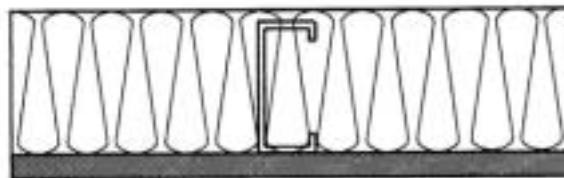
Figure 3-2 The AISI horizontal steel frame assembly model.

Values for Table 3-2 were calculated assuming this configuration. Note that, when the insulation depth is deep enough, it is assumed to cover the top of the steel section.