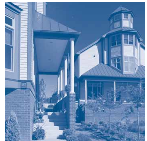
The National Green Home Building Guidelines will provide a valuable resource for those that do not already have a green building program.

For more information on the Guidelines, visit www.nahbr.org/greenguidelines . IB